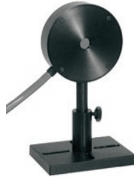
PD10 / PD10-pJ / PD10-IR-pJ