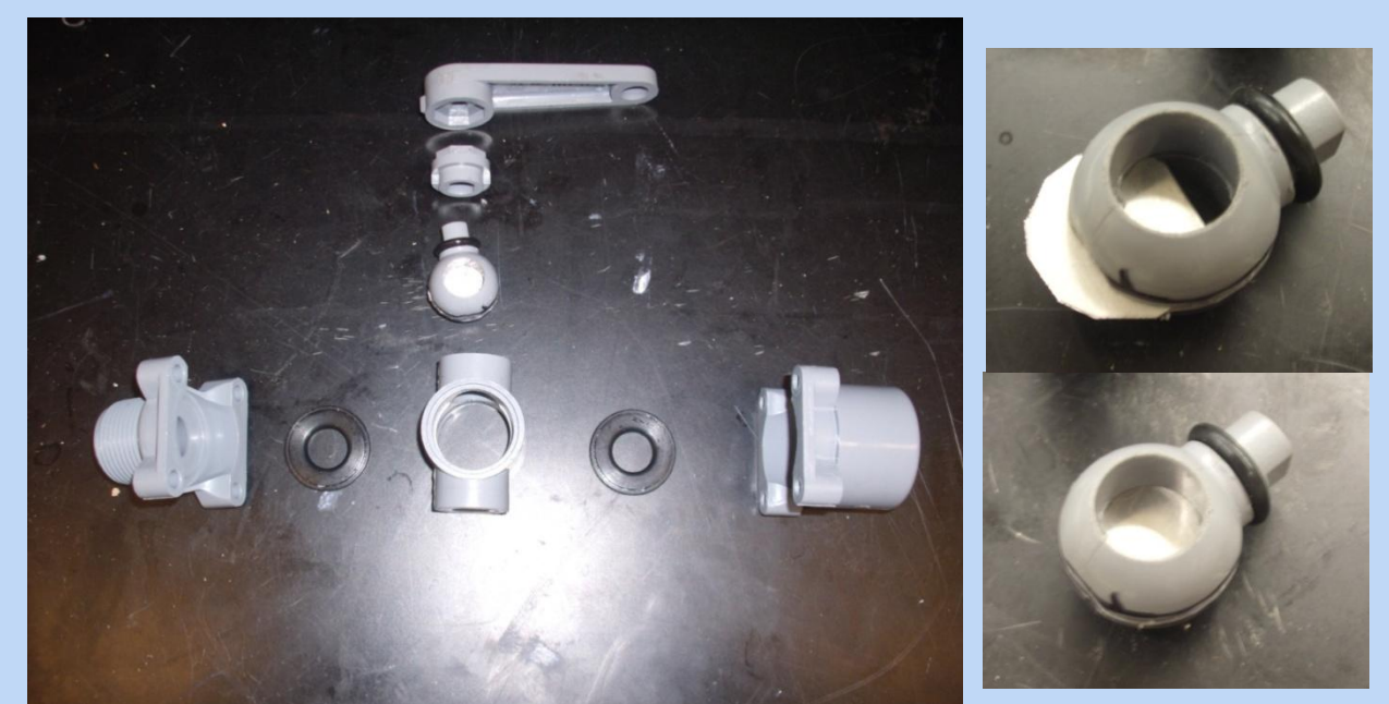
Valve and connectors