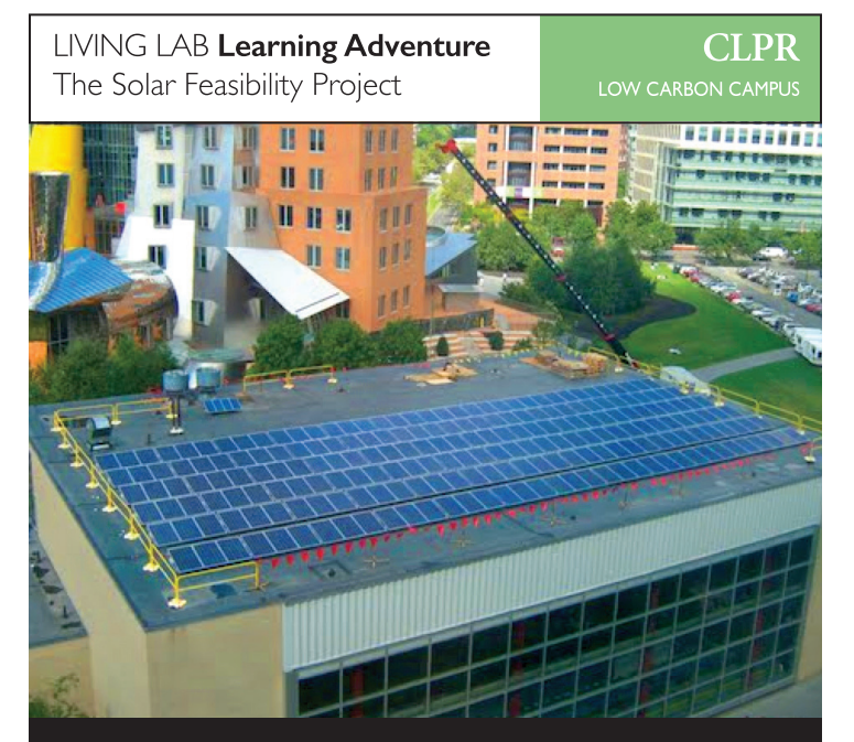
RESEARCH PROBLEM How many solar panels would fit on existing MIT roofs and how much they would cost?

Student teams explored solutions such as reimaging the Student Center building, developing a Green Space Committee, improving Social connectivity for student mental health, well-being, and resilience with transit structure improvements, underground infrastructure, linear wetlands, by linking MBTA and T public transportation networks and by reimagining the Kendall square plan.